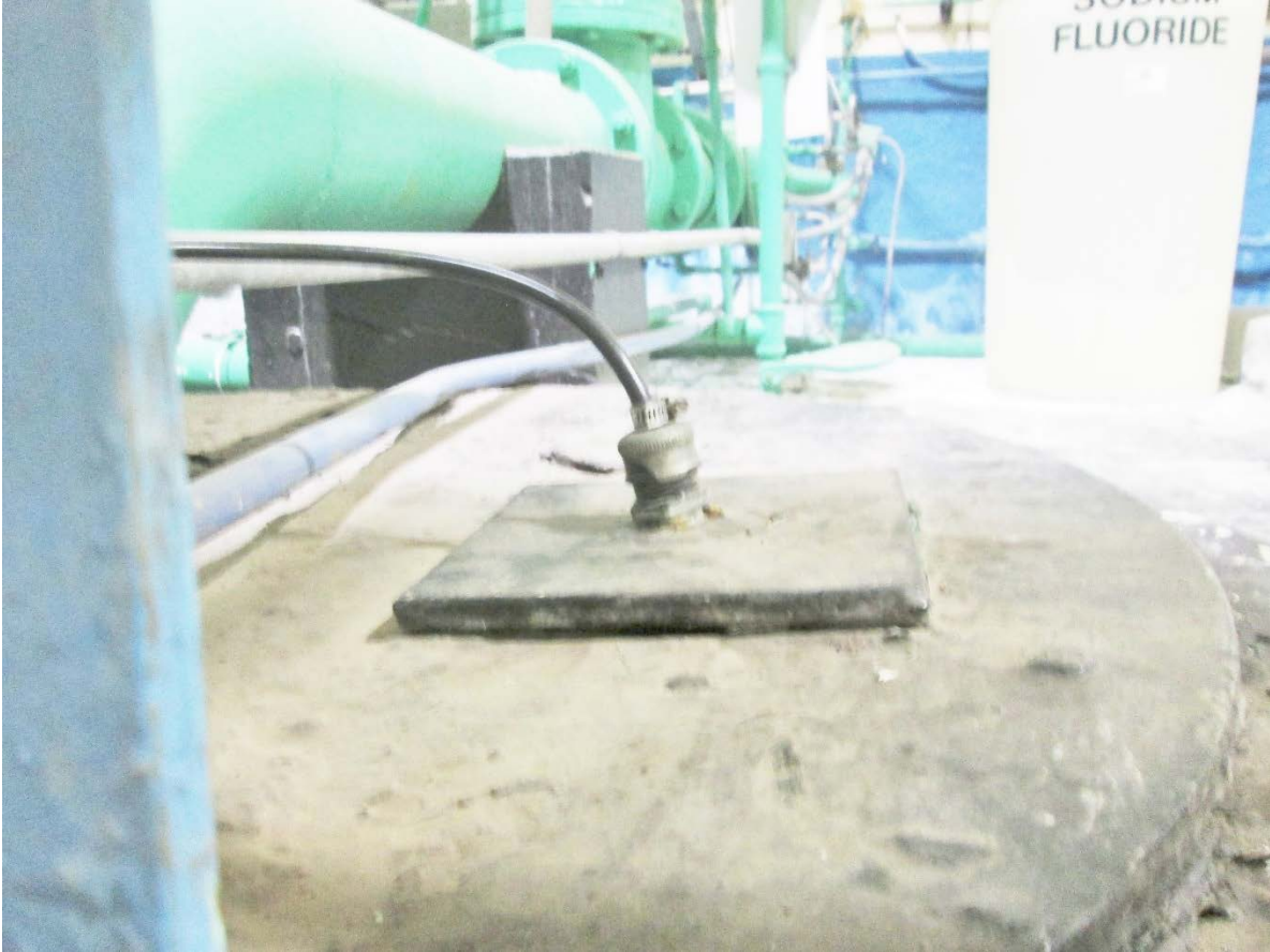
Red Hill Shaft: square baseplate on MP4's baseplate has a gap and should be sealed.