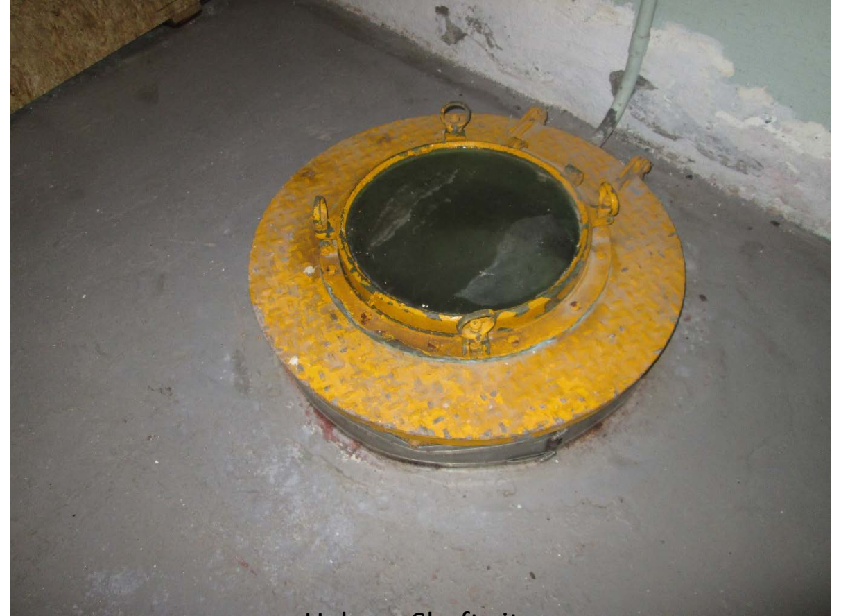
Halawa Shaft site