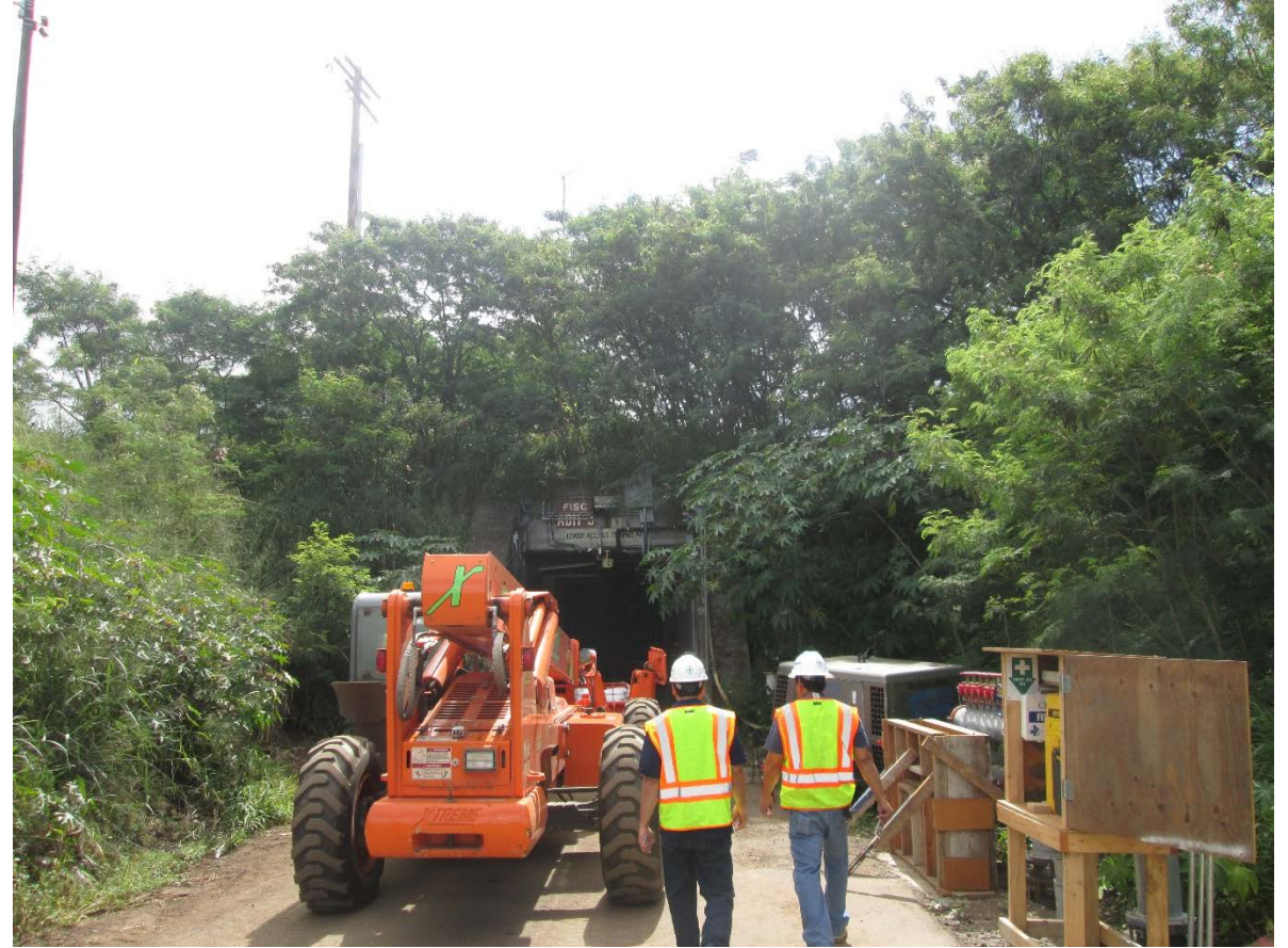
Red Hill Shaft site