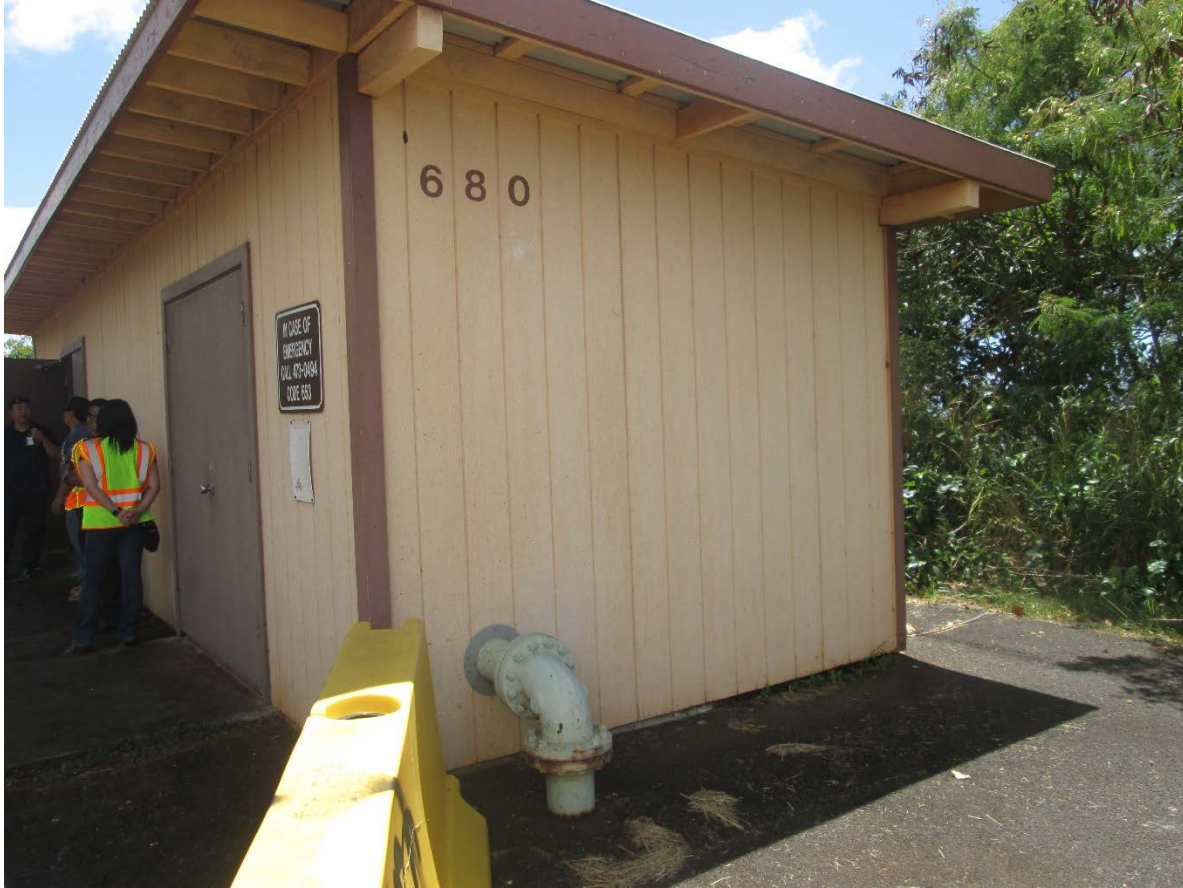
Camp Smith Booster Pump Station