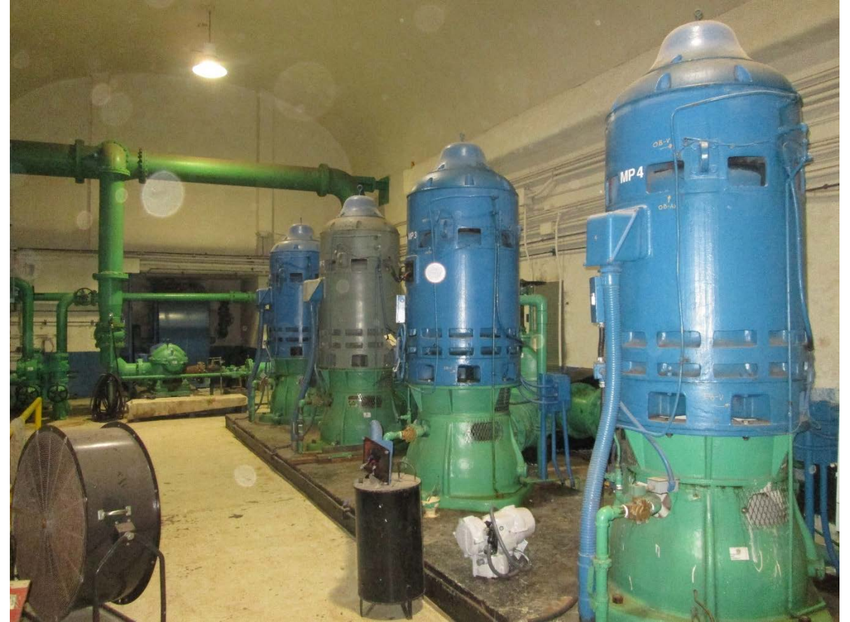
Red Hill Shaft site