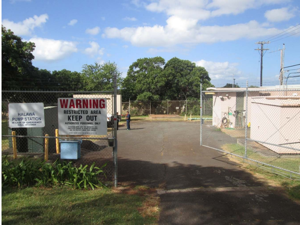
Halawa Shaft site