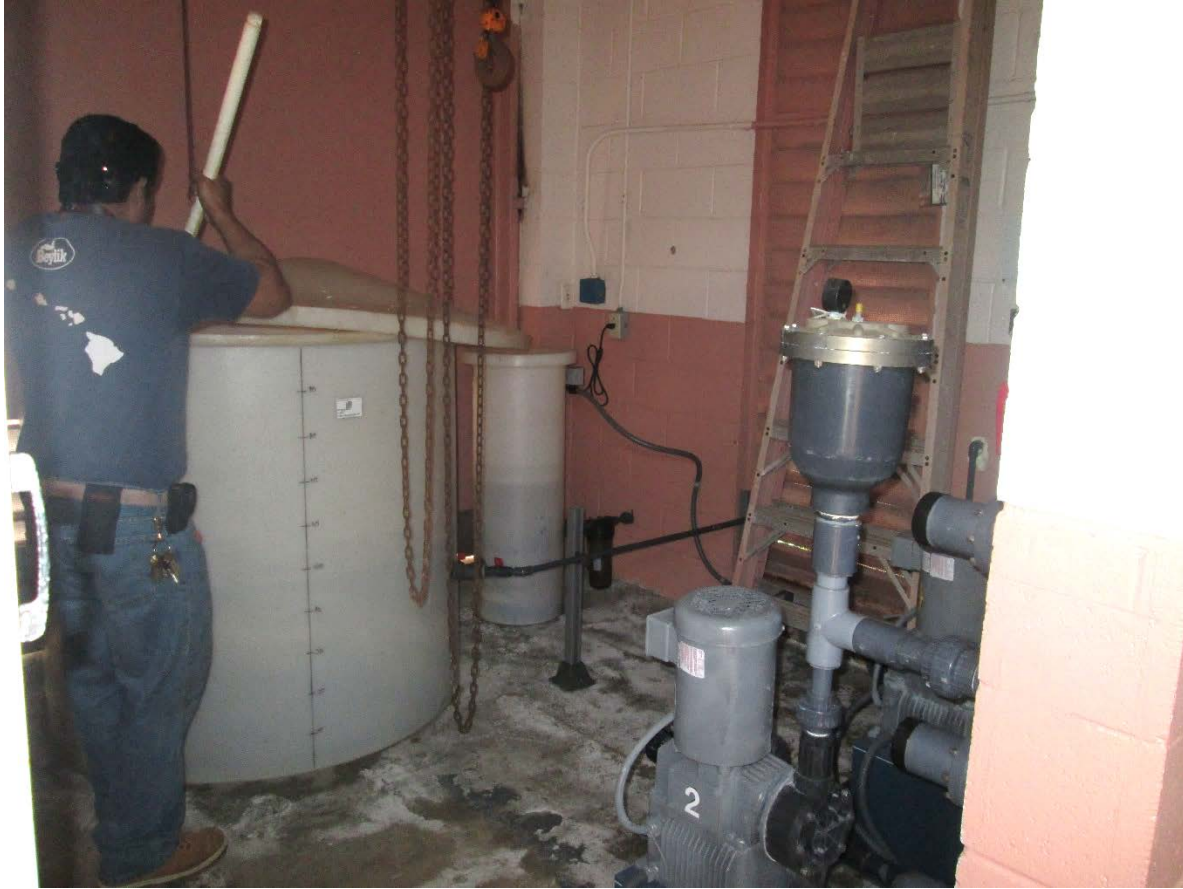
Red Hill Shaft site