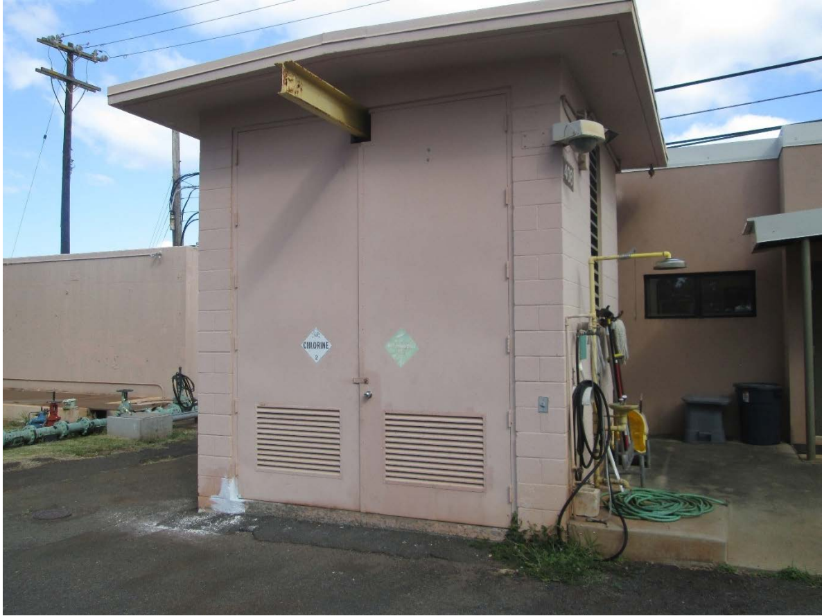
Halawa Shaft site