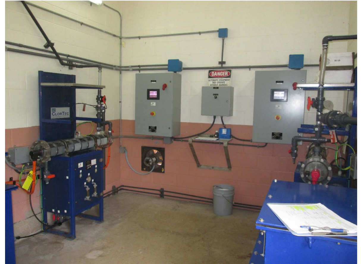
Red Hill Shaft site