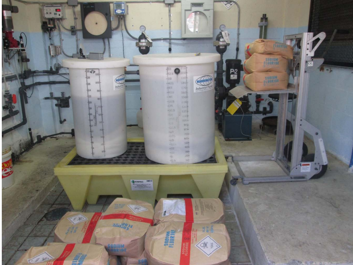
Waiawa Shaft site