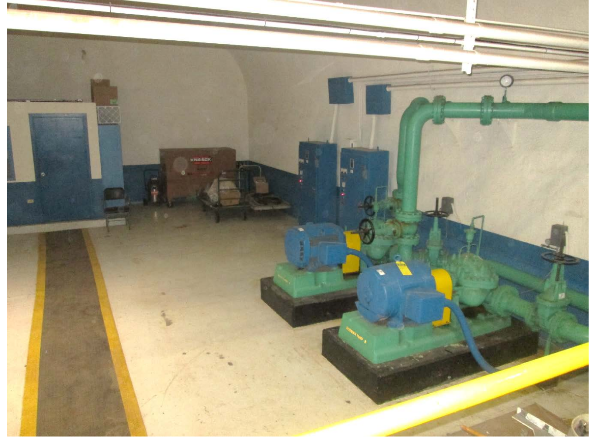
Red Hill Shaft site (Red Hill Booster Pumps)