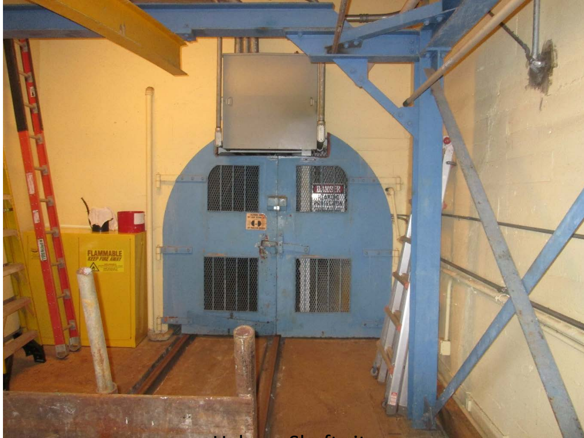
Halawa Shaft site