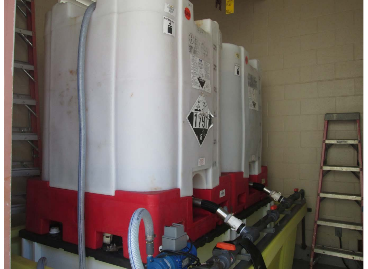
Waiawa Shaft site