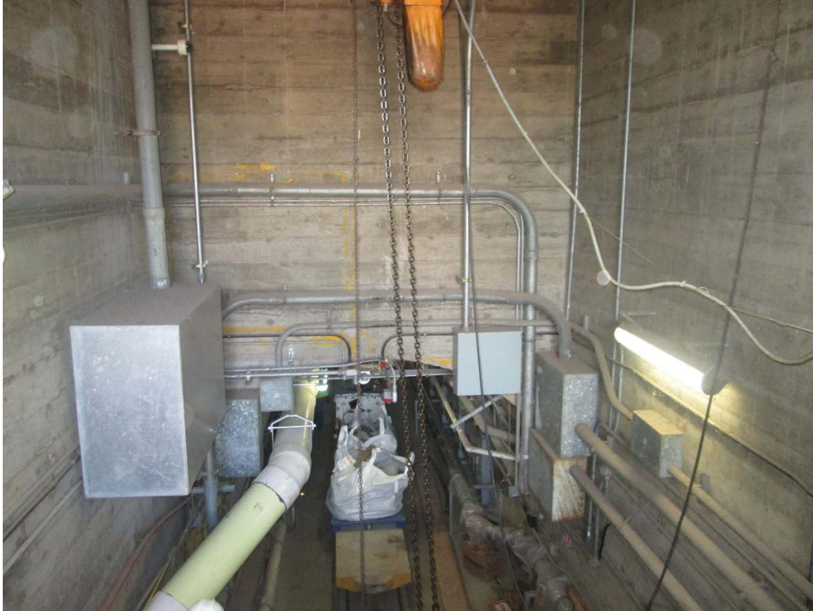
Red Hill Shaft site