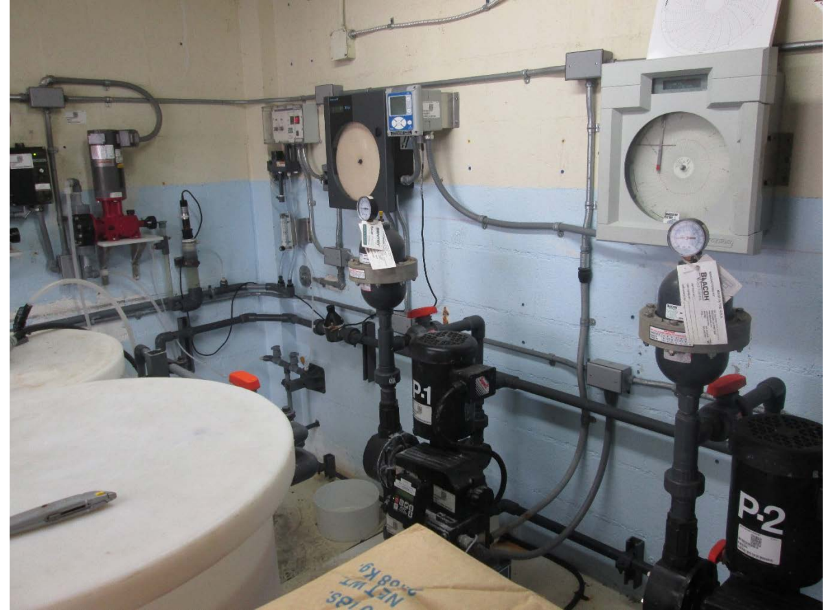
Waiawa Shaft site