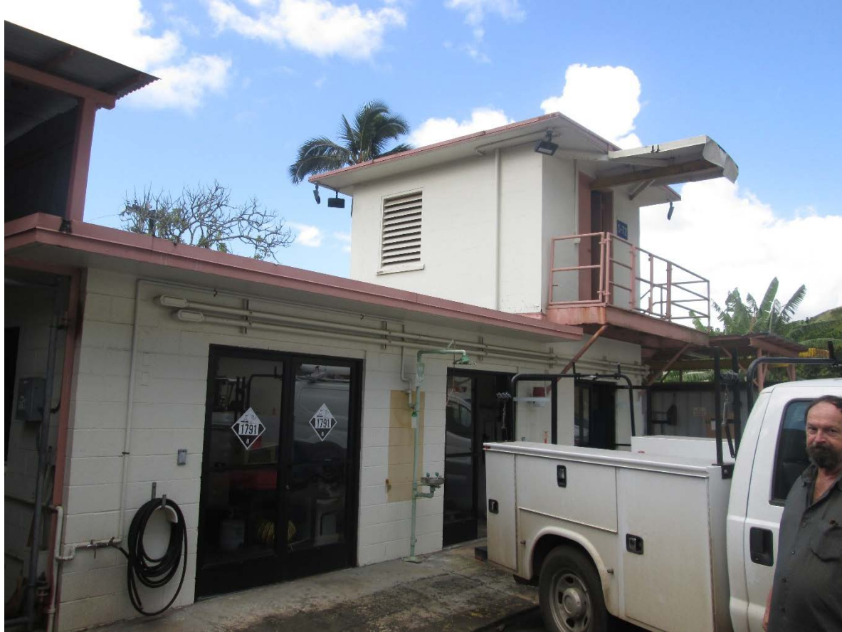
Waiawa Shaft site