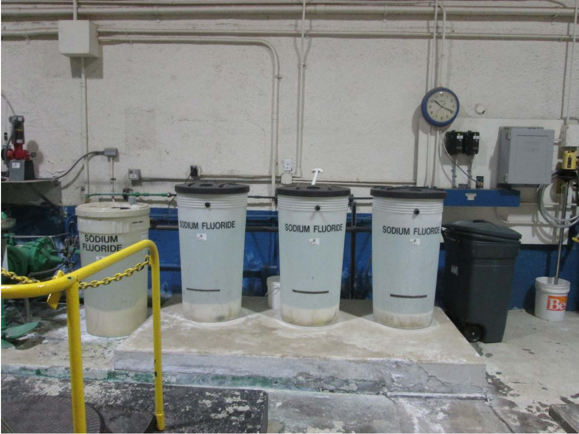
Red Hill Shaft site