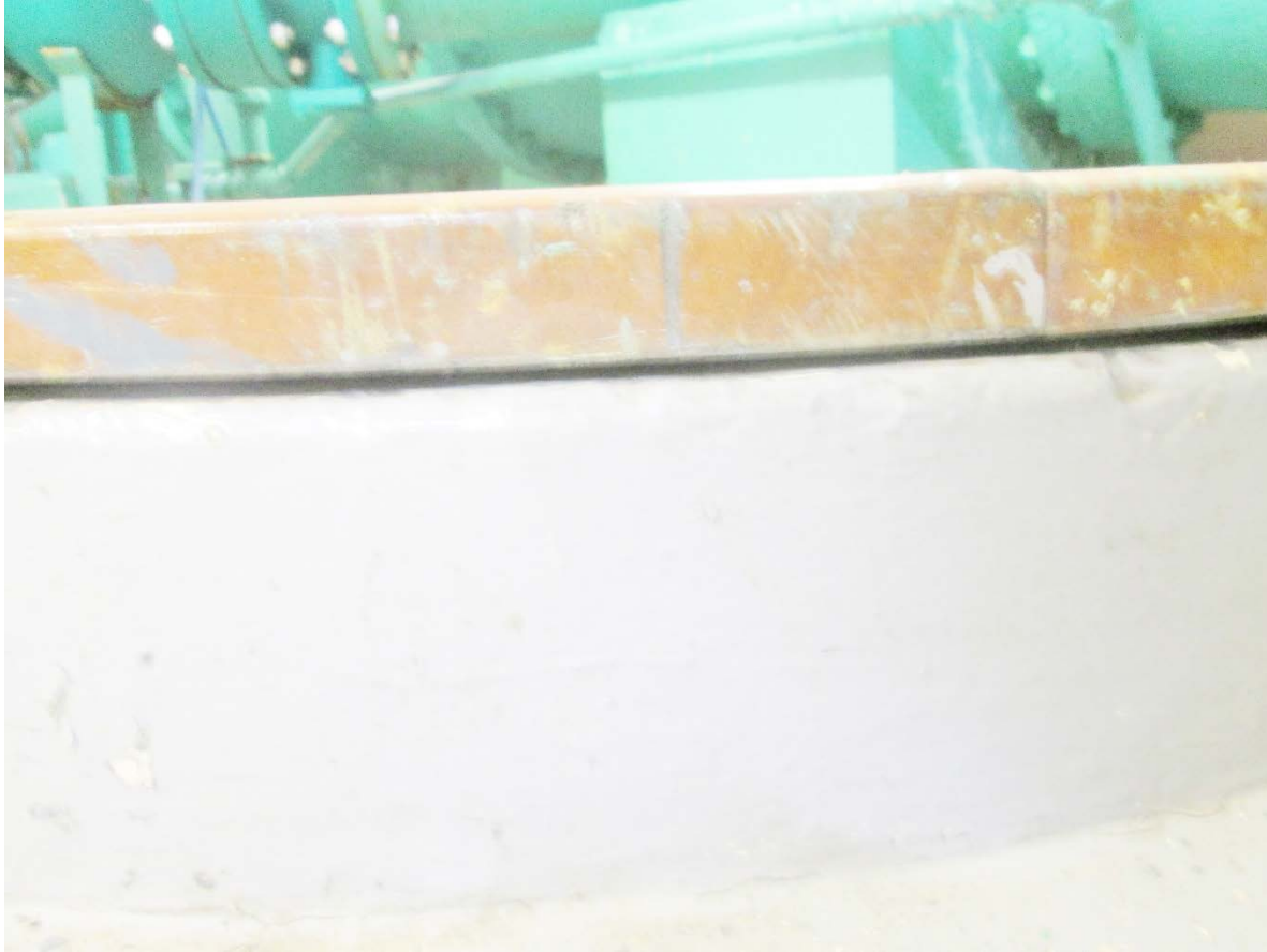
Waiawa Shaft: confirm that the shaft viewing hatch has a gasket between the cover and the frame curb.