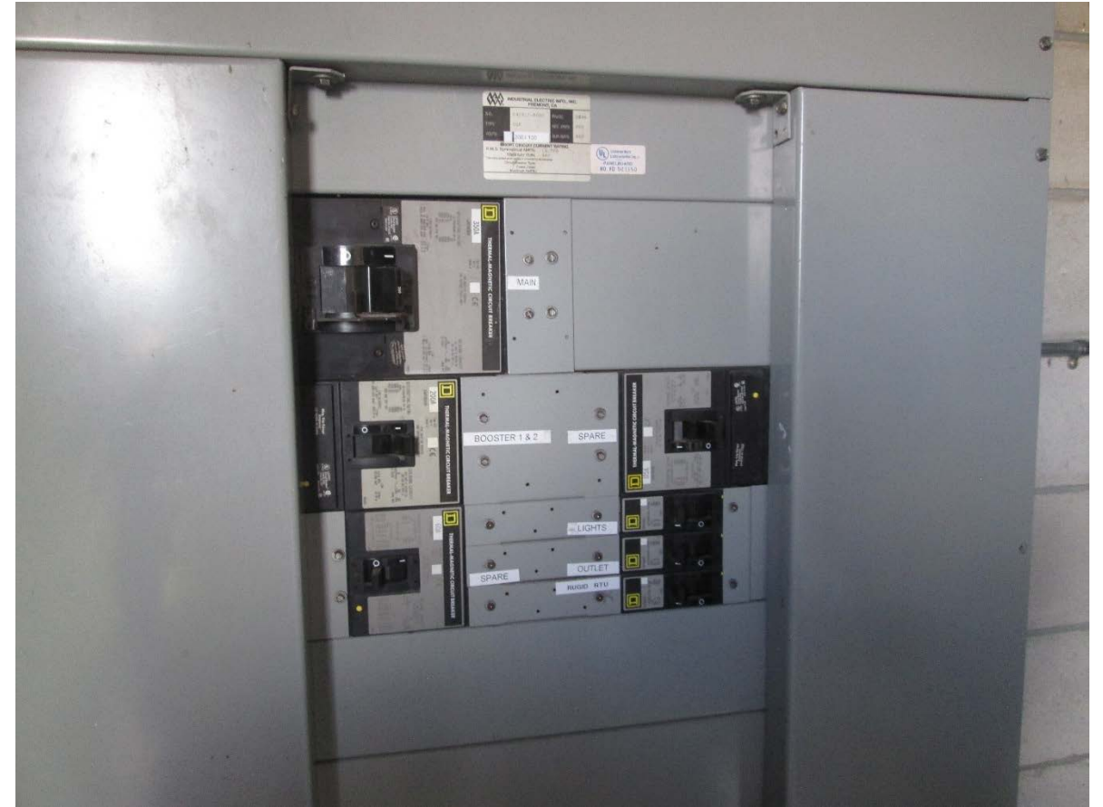
Moanalua Terrace Booster Pump Station