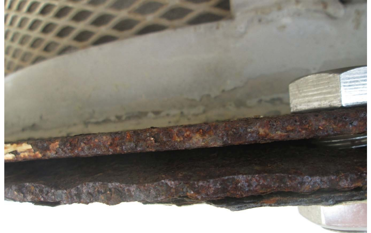
Halawa S-1 Tank: there are gaps between the flanges of the vent screen and the pedestal (daylight was seen through this gap)