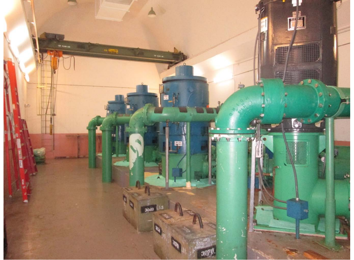
Waiawa Shaft site