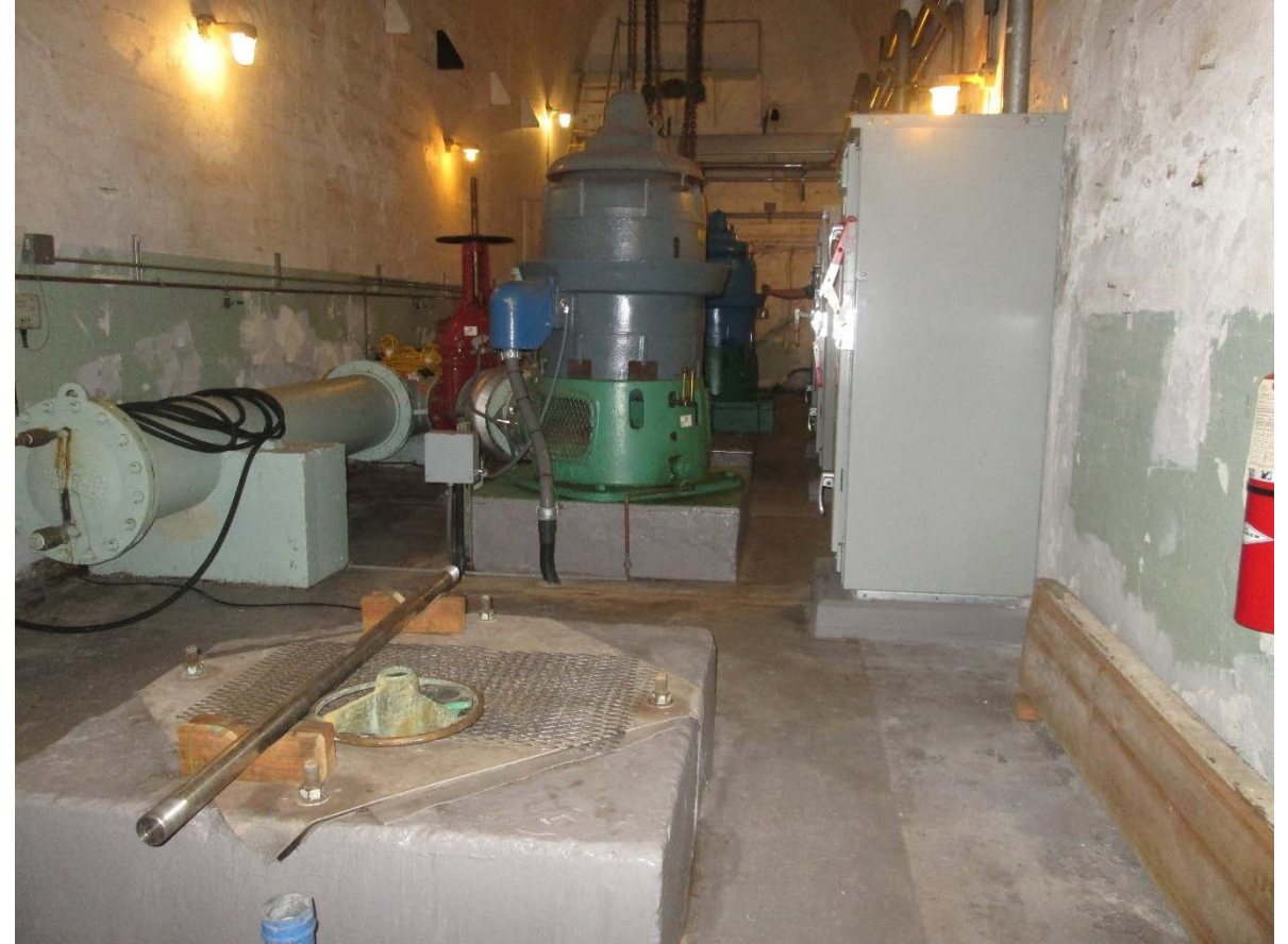
Halawa Shaft: confirm that the opening into the shaft where the pump and motor was permanently removed from service is sealed.