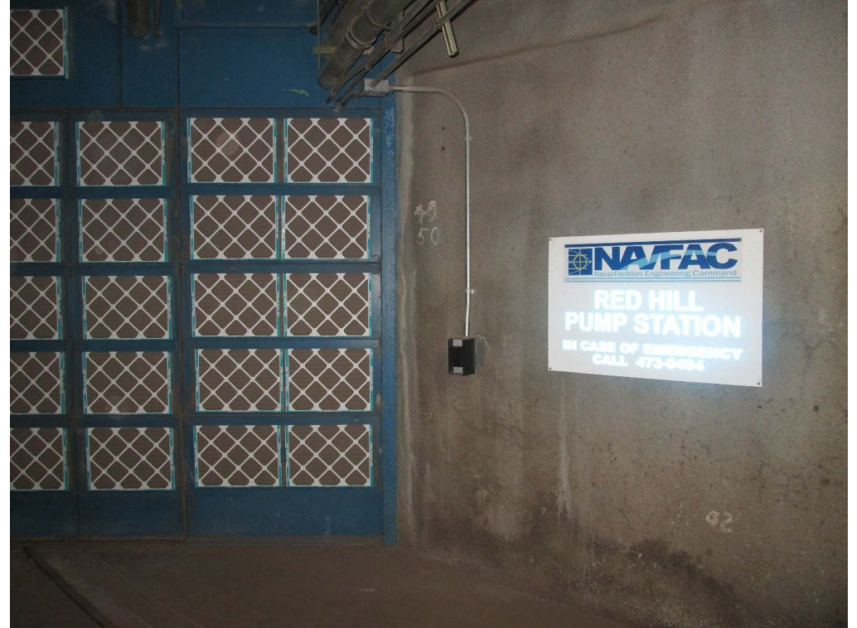
Red Hill Shaft site