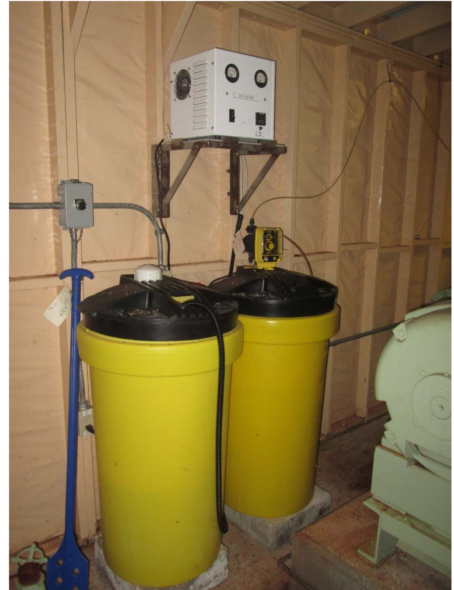
Camp Smith Booster Pump Station