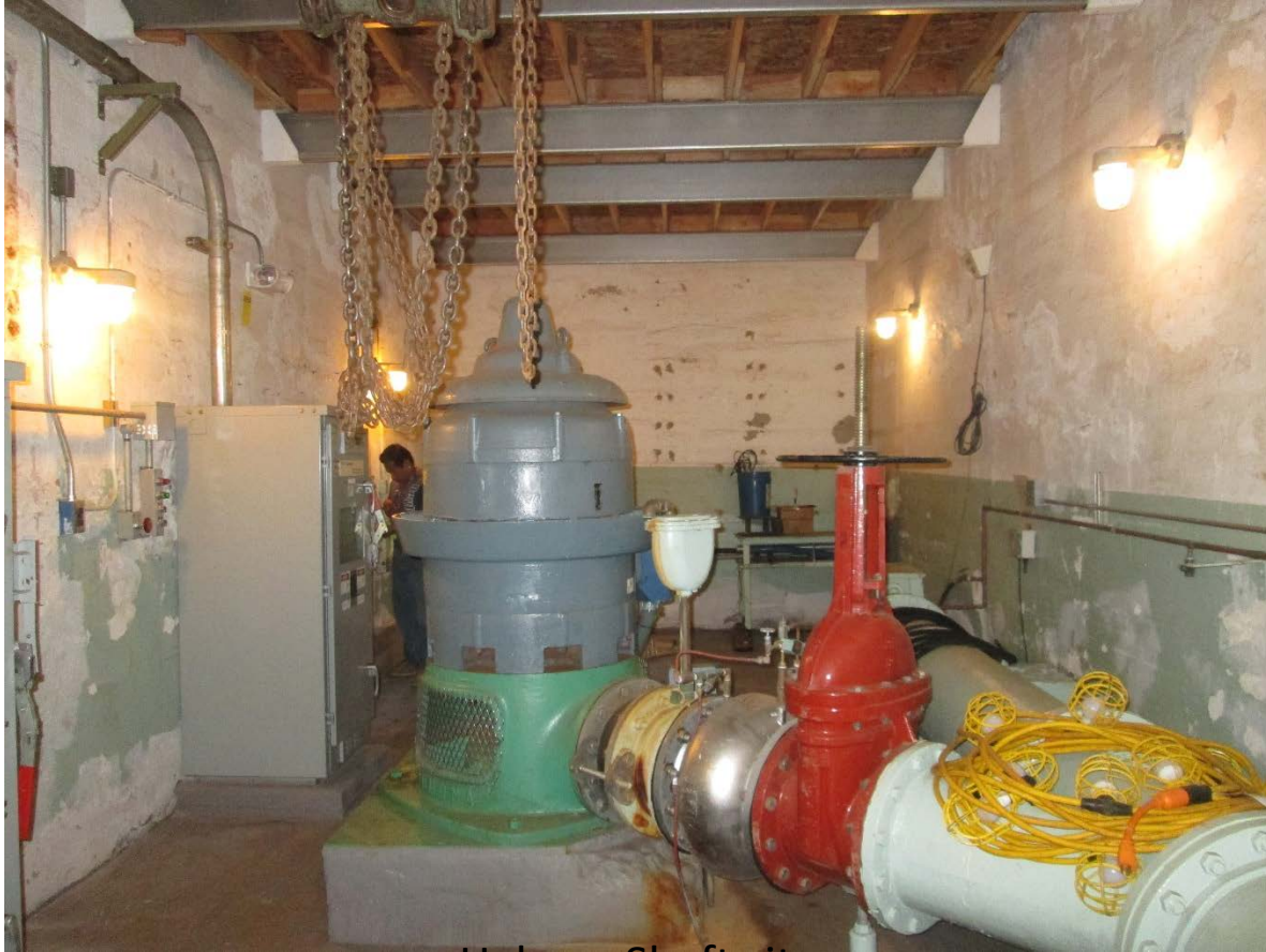
Halawa Shaft site