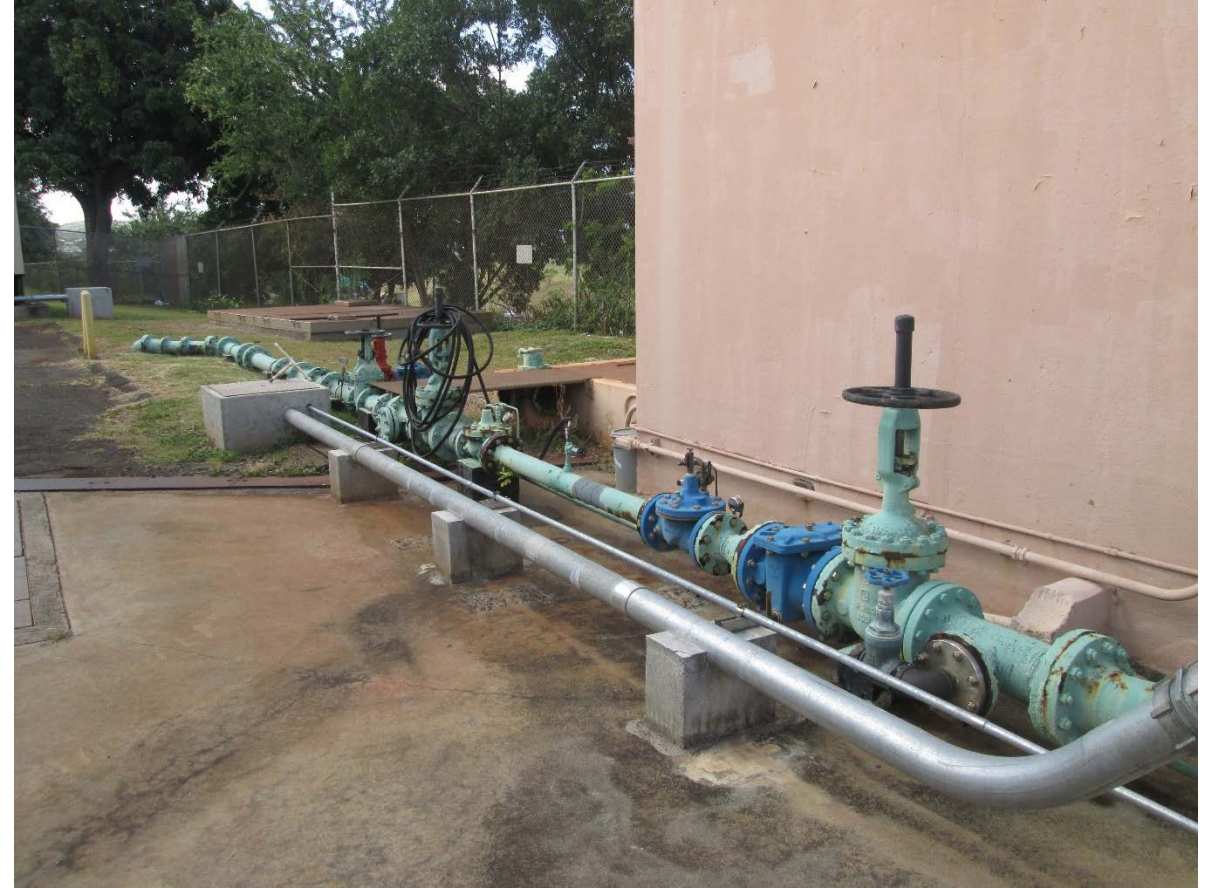
Halawa Shaft site