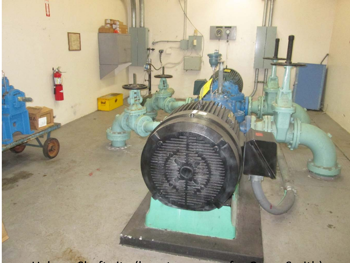
Halawa Shaft site (booster pumps for Camp Smith)