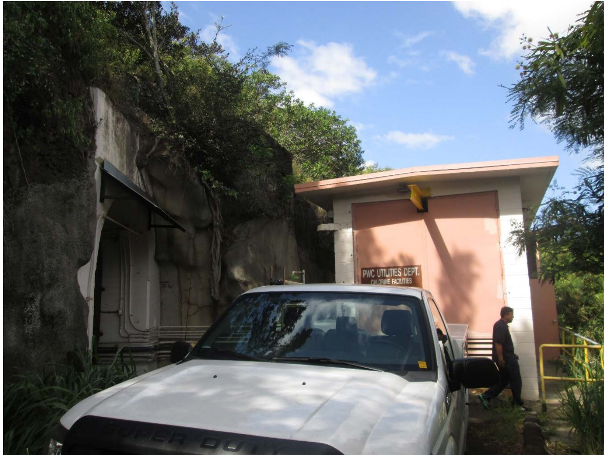
Red Hill Shaft site