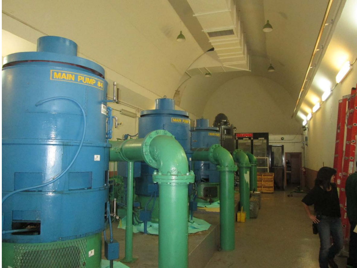
Waiawa Shaft site