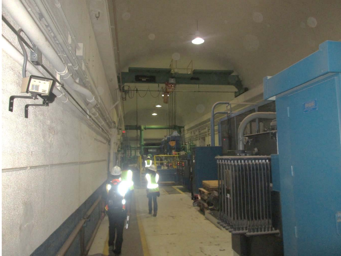
Red Hill Shaft site