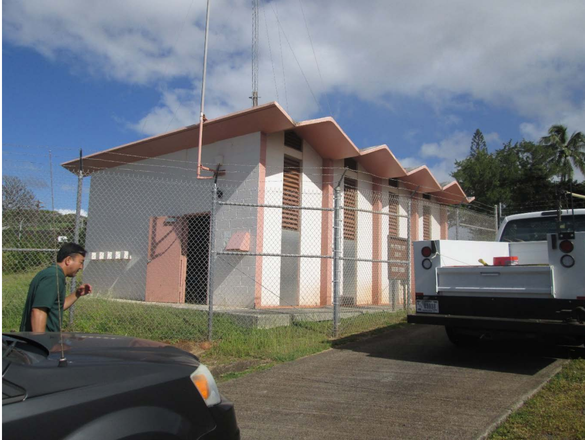
Manana Booster Pump Station