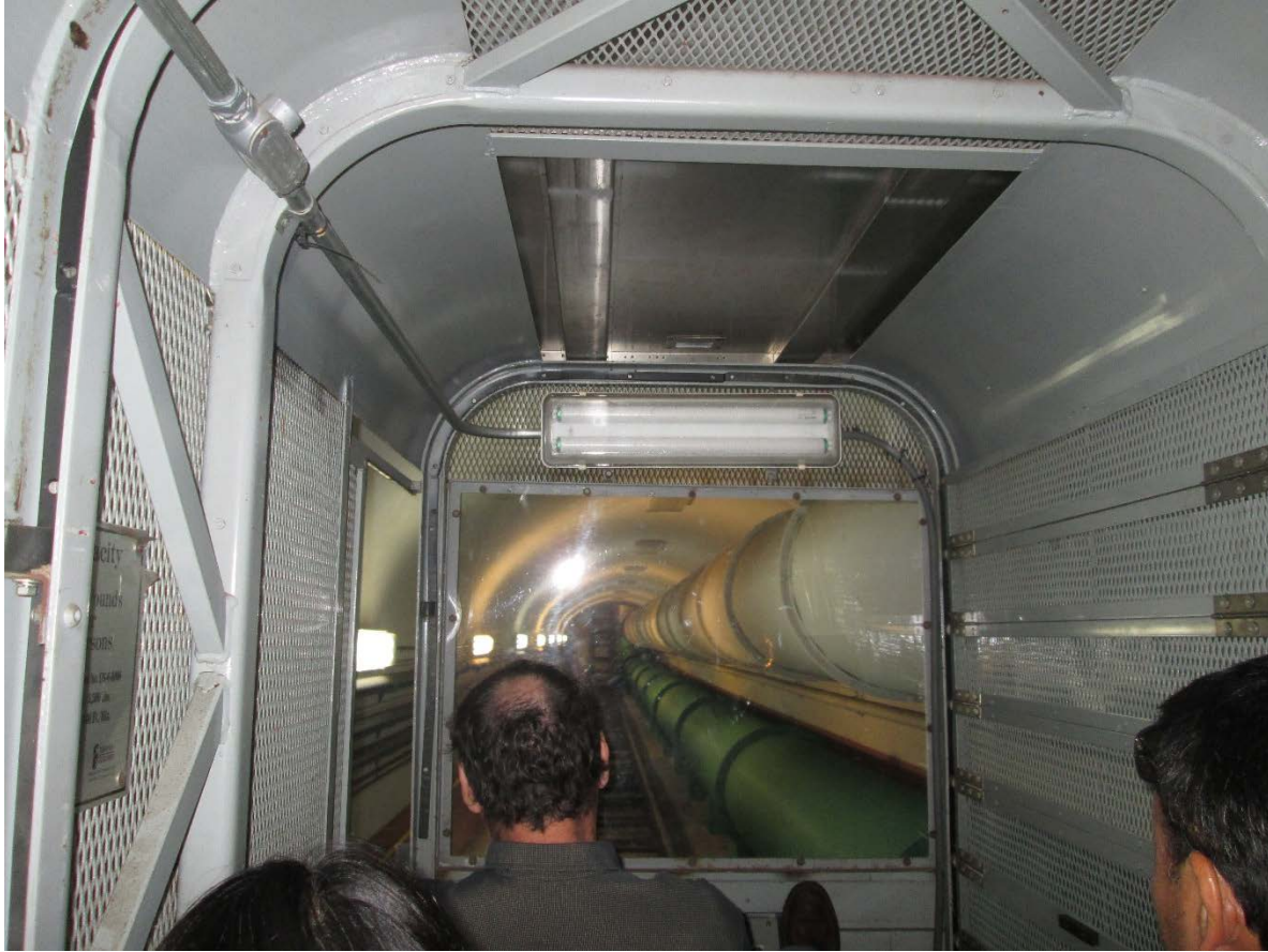
Waiawa Shaft site