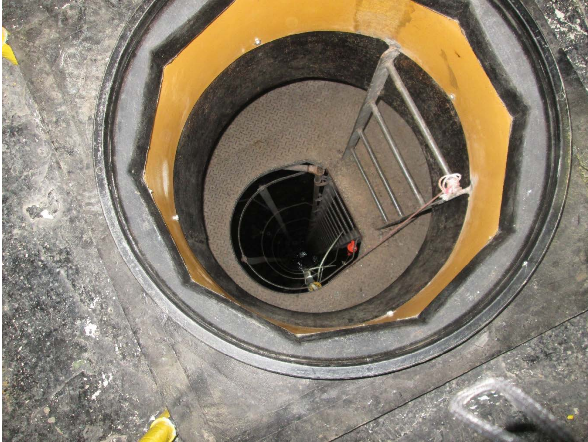
Red Hill Shaft site