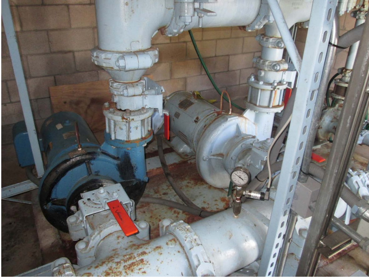
Moanalua Terrace Booster Pump Station