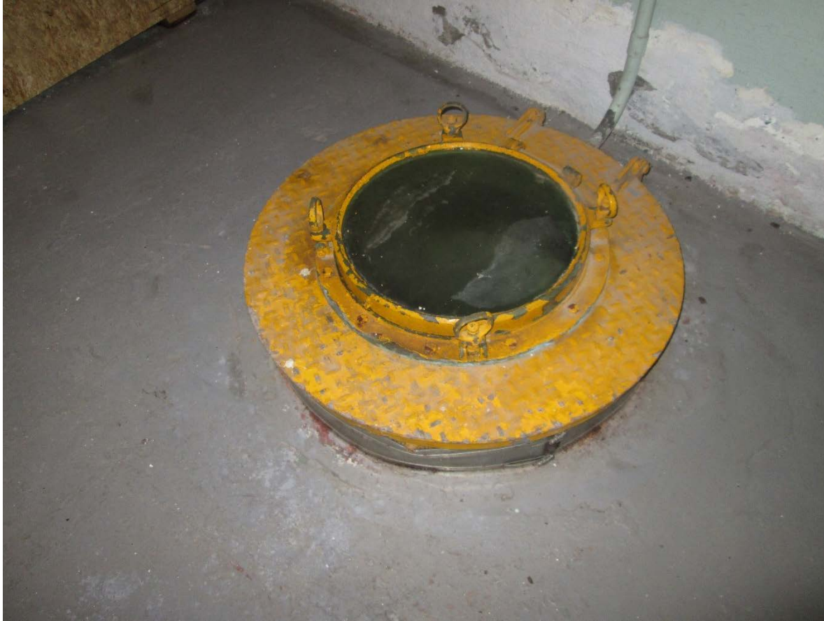
Halawa Shaft: confirm that the shaft viewing hatch has a gasket between the cover and the frame curb.