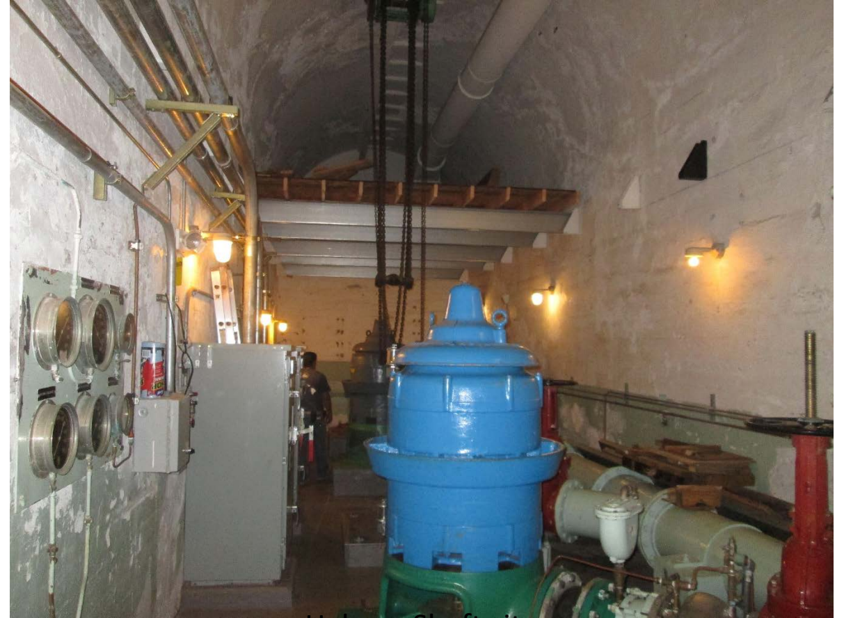
Halawa Shaft site