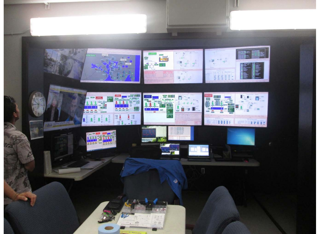
Waiawa Shaft site