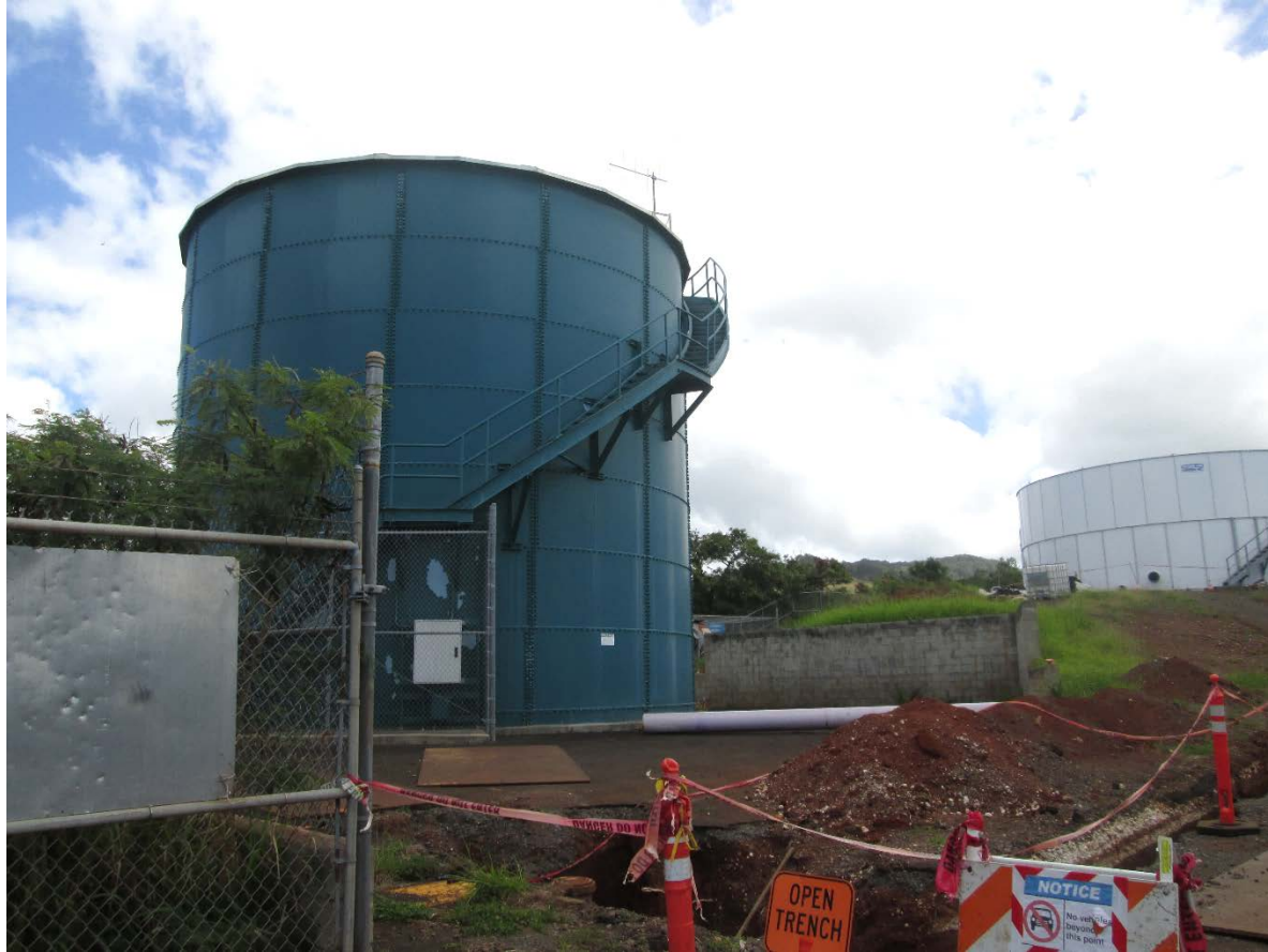
Red Hill Tank. Unapproved tank (white) under construction.