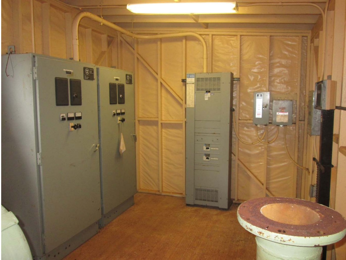
Camp Smith Booster Pump Station