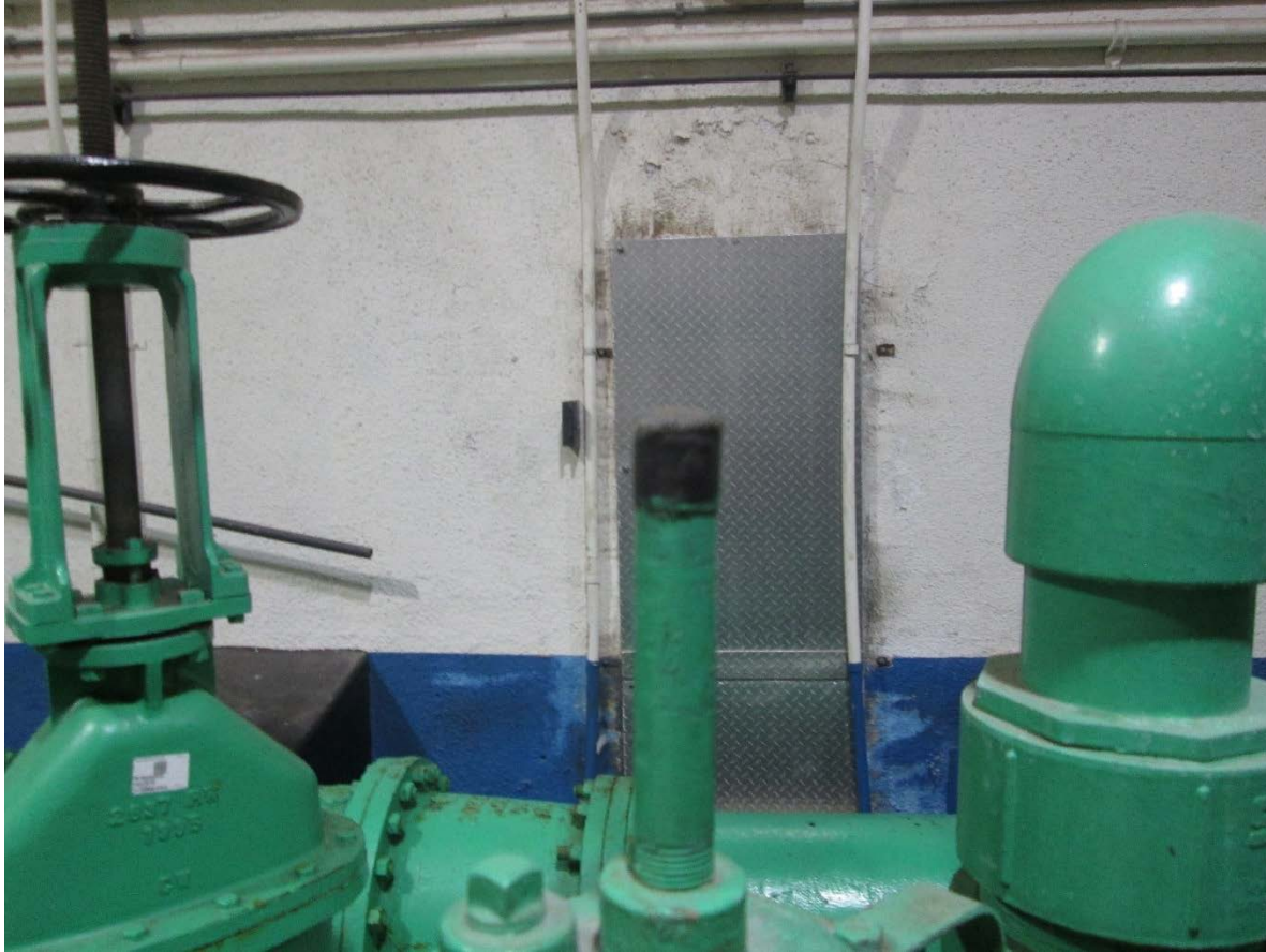
Red Hill Shaft: an ARV on the discharge pipe is pointed up and should be pointed down.