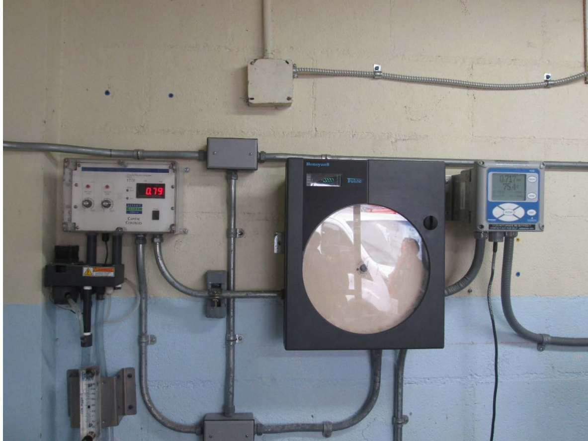
Waiawa Shaft site