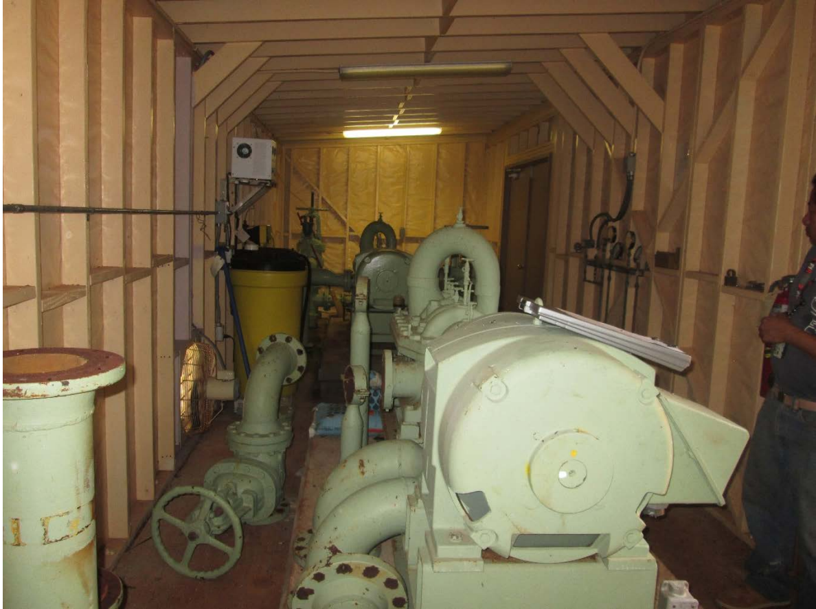
Camp Smith Booster Pump Station