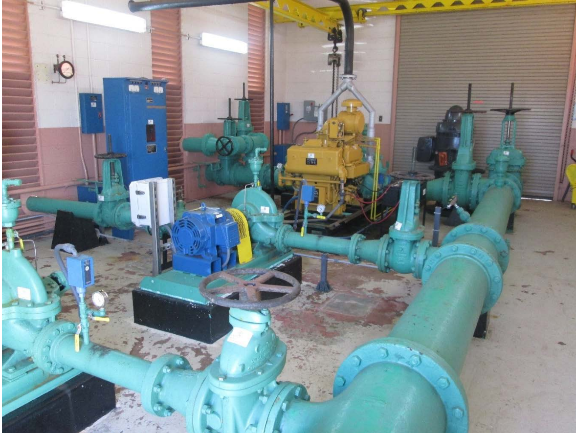
Manana Booster Pump Station: ARV pointing sideways and should be pointed down.