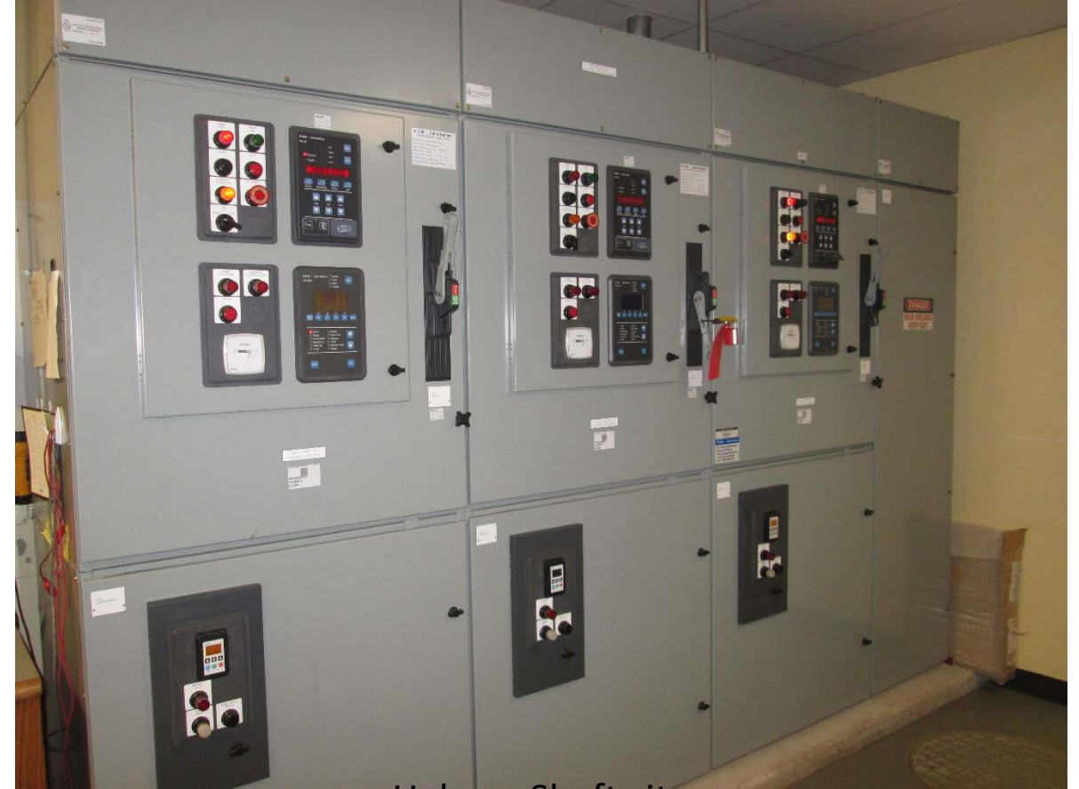
Halawa Shaft site