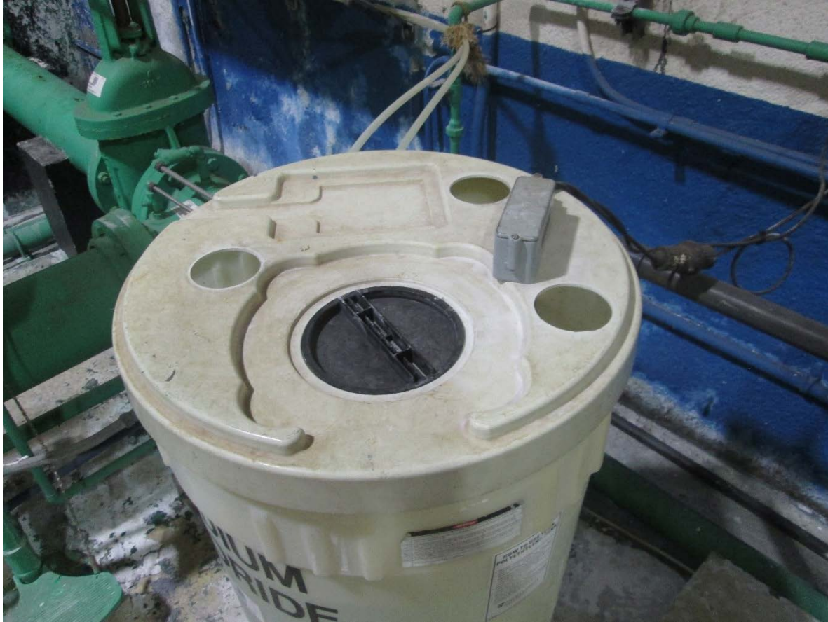
Red Hill Shaft: the sodium fluoride container has open holes on top and should be sealed.