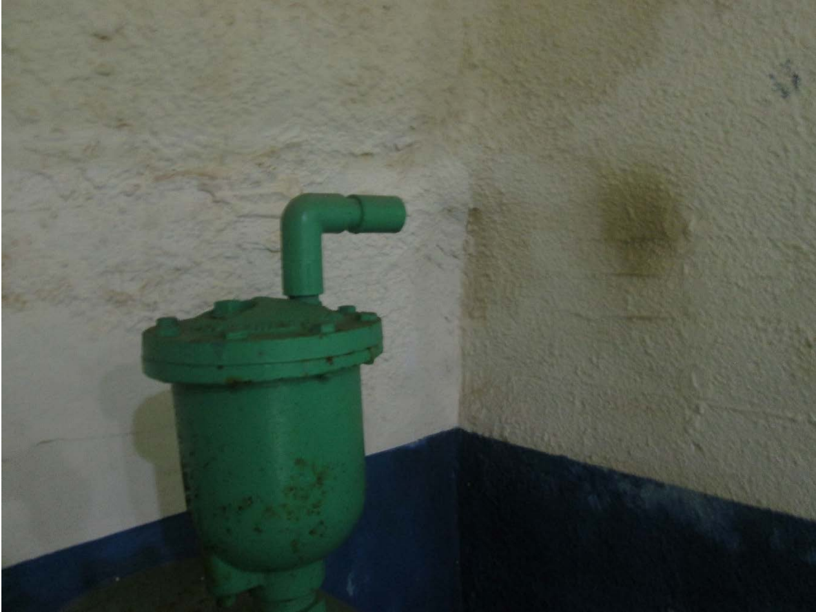
Red Hill Shaft: an ARV on the discharge pipe is pointed sideways and does not have an insect screen. ARV should be pointed down and covered with an insect screen.