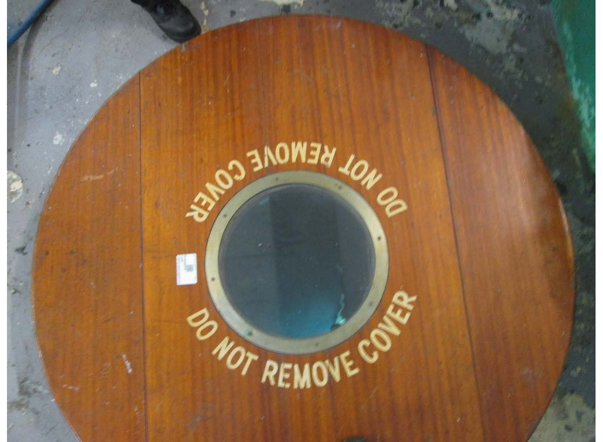
Waiawa Shaft site