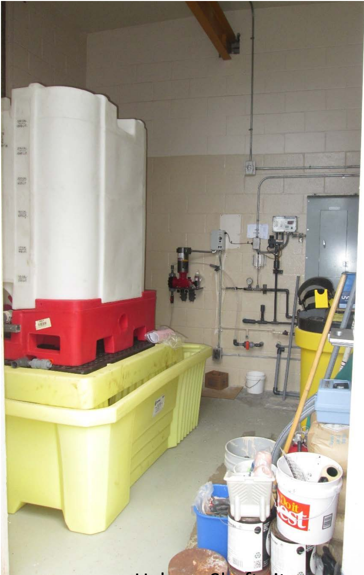
Halawa Shaft site