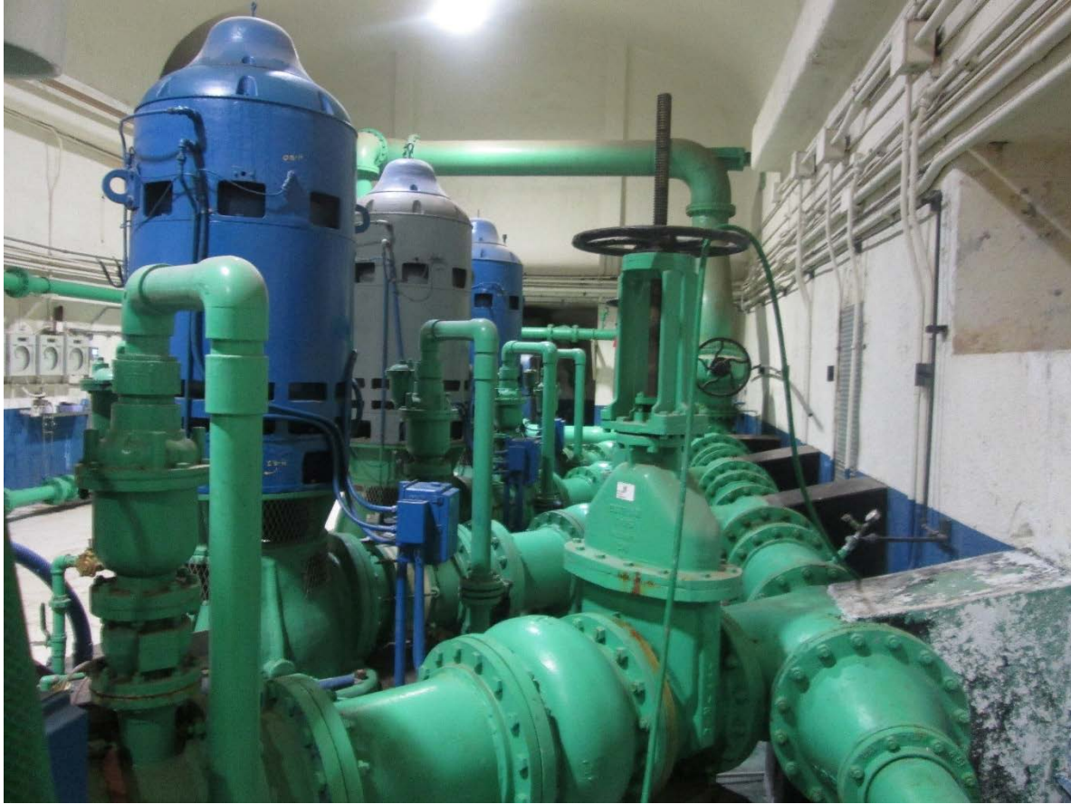
Red Hill Shaft site