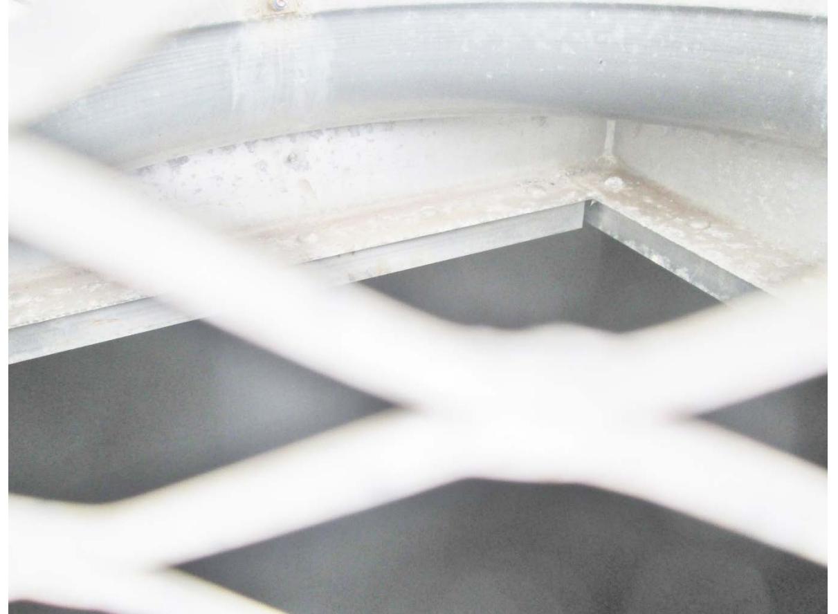
Red Hill Tank: an insect screen is missing from the vent.