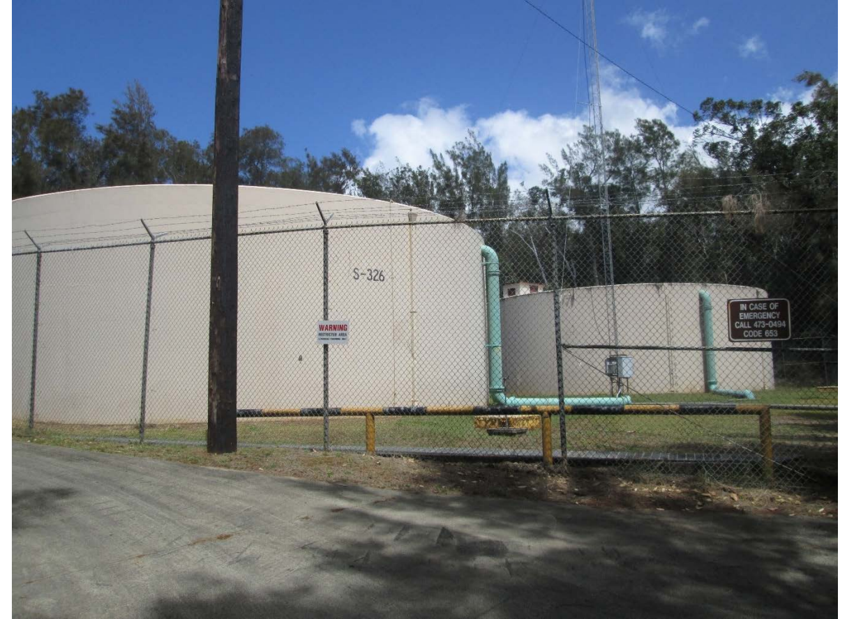
S-325 and S-326 Tank site