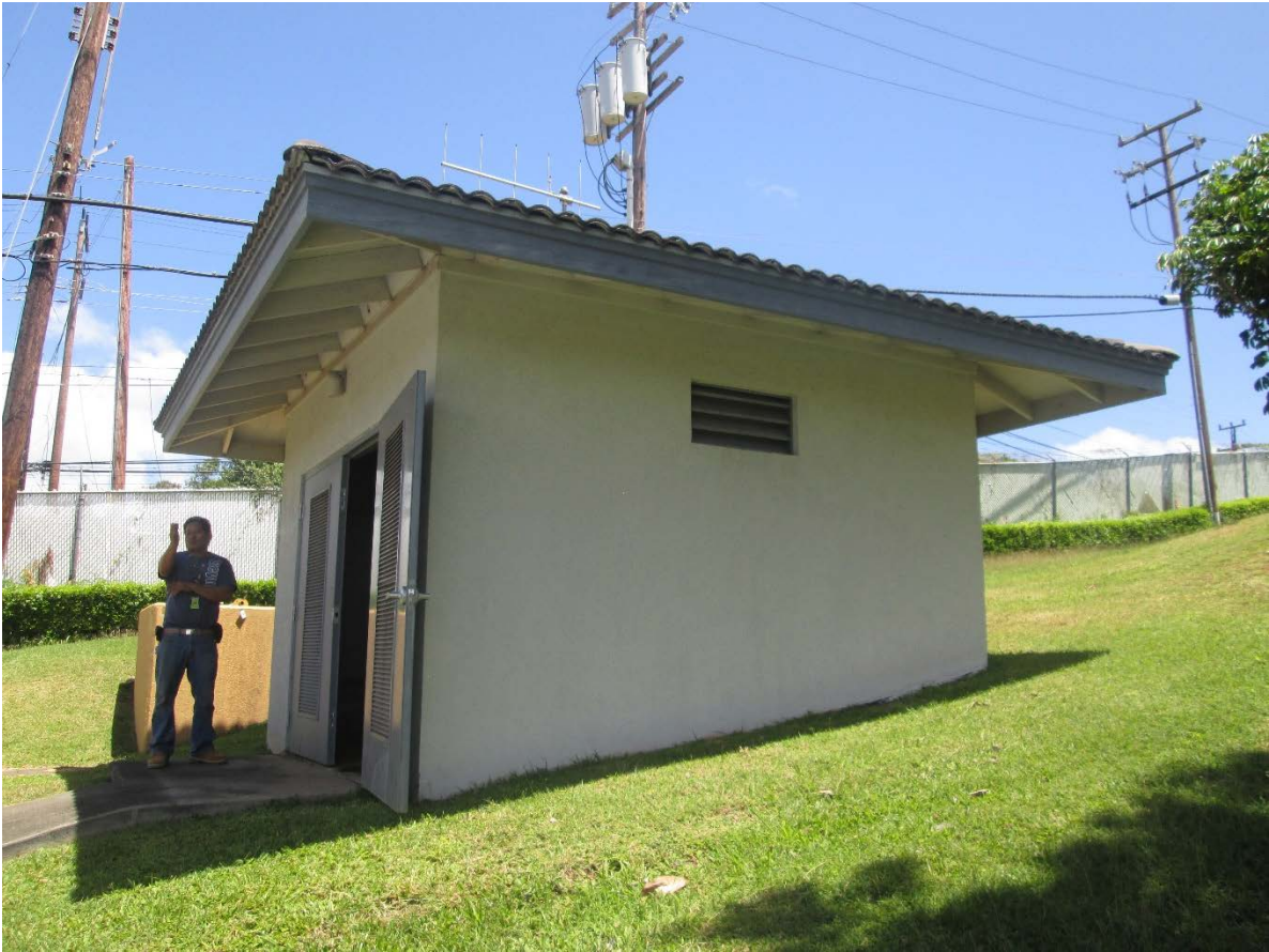
Moanalua Terrace Booster Pump Station